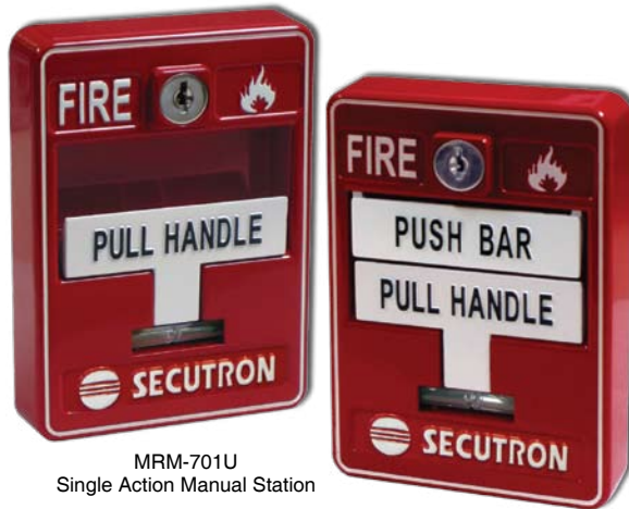
MRM-701U Single Action Manual Station